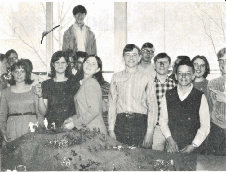
Cedant Arma Togae (Let Arms Yield to the Toga)

On your mark, get set, the race is about to start.