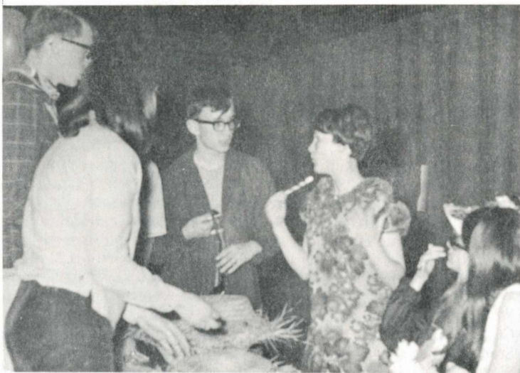
Political conventions are serious business.

"You can't clear your own fields while you're counting the rocks on your neighbor's farm," says The Post-Telegram of Princeton, Mo.