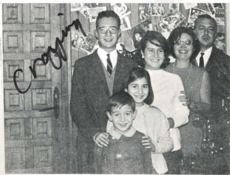
Next year's foreign exchange student poses with her family.